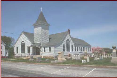
Cross Roads United Methodist Church