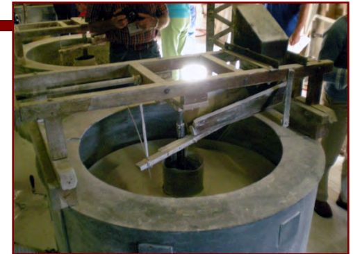
▲ Grinding at Atkinson Mill

It was at the Old Gilliam Mill that the "spoomers" had a hearty barbecue. Along with the excellent food there was a group of 5 country musicians who entertained the SPOOM group.