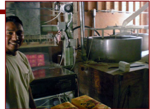
▲ Buffaloe Mill Miller

There was a fish weathervane on the roof of the mill. Fish weather vanes were symbolic requests for prosperity and God's blessing. The present weathervane represents the Roanoke bass fish, or the redeye fish, a rare game fish in the