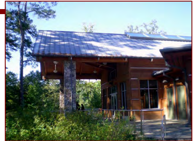
Yates' Mill Visitor Center ▲

The Sanford Milling Co. is owned and operated by four generations of the Harkness family. The mill is six stories high and fully pneumatic. This was a mechanical operated mill until 1961. The mill can store up to 180,000 bushels of grain. The mill grinds at the rate of 100 bushels per hour. They grind wheat of which 50% is obtained locally. There is a hammer mill that makes animal food. The mill has seven roller machines. Some of the roller machines were dated 1900 and still operating. The mill operates on a 16 hour day.