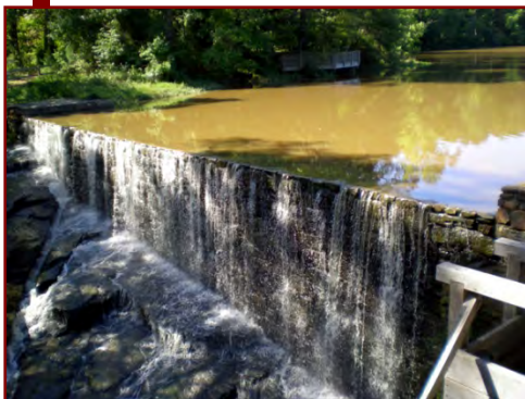
◀ Yates' Mill Dam